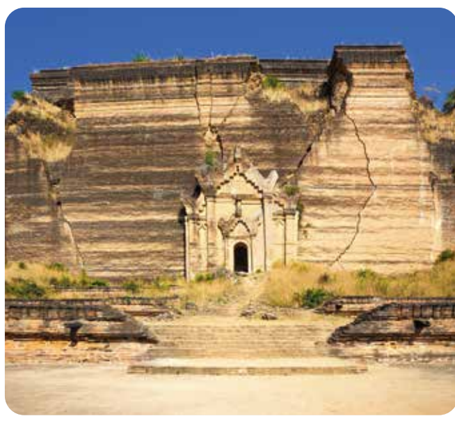
Impact of earthquake in Mingun Pahtodawgyi Temple

The shaking of an earthquake may cause windows to break, houses to collapse or the outburst of fire due to damaged power lines. An earthquake can cause also additional hazards such as landslides, mud vulcano eruptions, tsunamis and flooding.