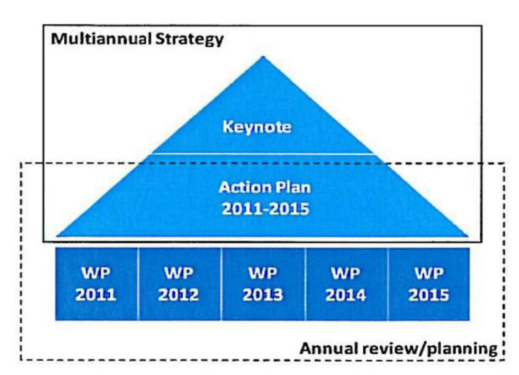
Figure 2: EUCPN's Multiannual Strategy and annual planning

The EUCPN's basic goals are reaffirmed in the Multiannual Strategy which was adopted by the Board in December 2010 for the period 2011 until the end of 2015, as shown in figure 2 below. The Multiannual Strategy 2011-2015<sup>37</sup> sets out the long-term orientations for the Network.